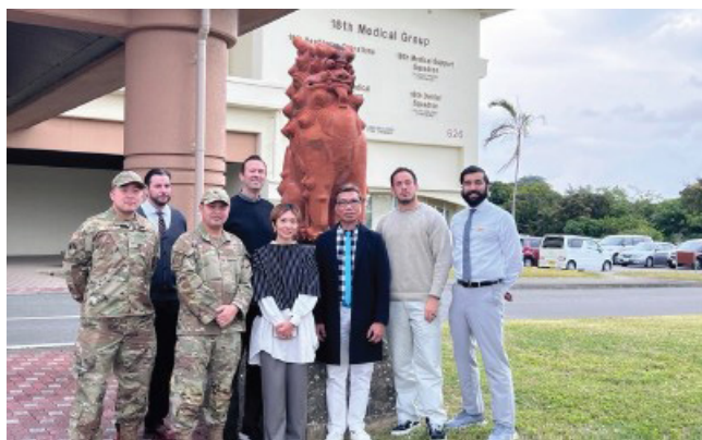
The DHA HFEP Team & 18th MDG's workshop attendees

Enhance Military Health System readiness and resiliency by safeguarding human health and the environment through the efficient use of resources and ongoing process improvement.