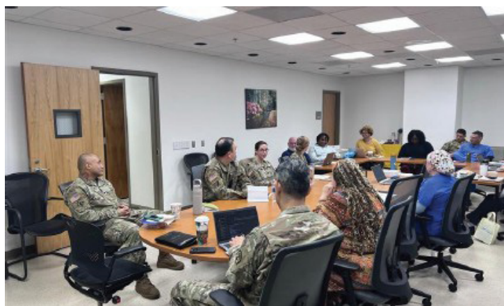
Refresher HFEP workshop at Womack Army Medical Center.